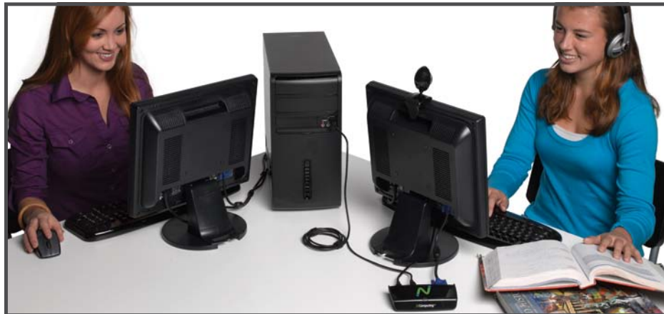
The U170 is ideal for classrooms, public access, small business, digital signage, and home use.

Desktop virtualization does not have to be complex. Or expensive. Unlike other desktop virtualization solutions, NComputing does not need expensive and complicated servers and infrastructure. In fact, vSpace was designed to efficiently share the normally wasted CPU cycles in standard low-cost PCs. In an NComputing solution, vSpace creates multiple virtual workspaces in one physical computer, and then the additional users connect their monitors, keyboards, and mice, through a simple access device. With the U170, connecting the access device to the shared computer couldn't be easier: just snap them together with the included USB cable.